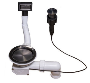
Space Push Gun Metal automatic waste fitting - PO